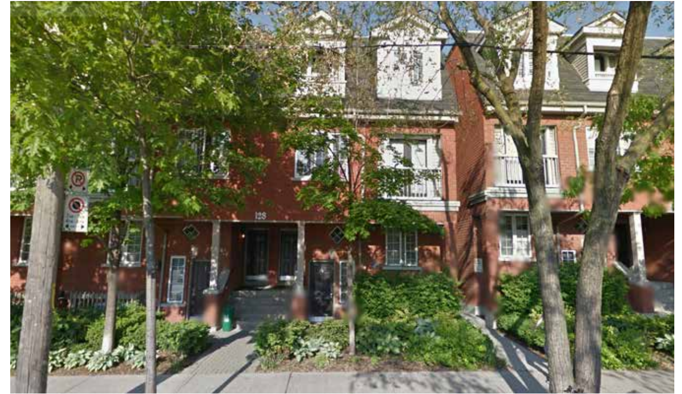
Three Storey Stacked Townhouses: Double units with entrances at grade - one flush with sidewalk and one stepped up