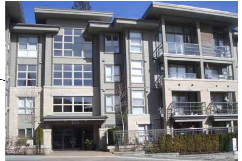
Three/Four Storey Apartments (Condo) - Shared entrance to upper units