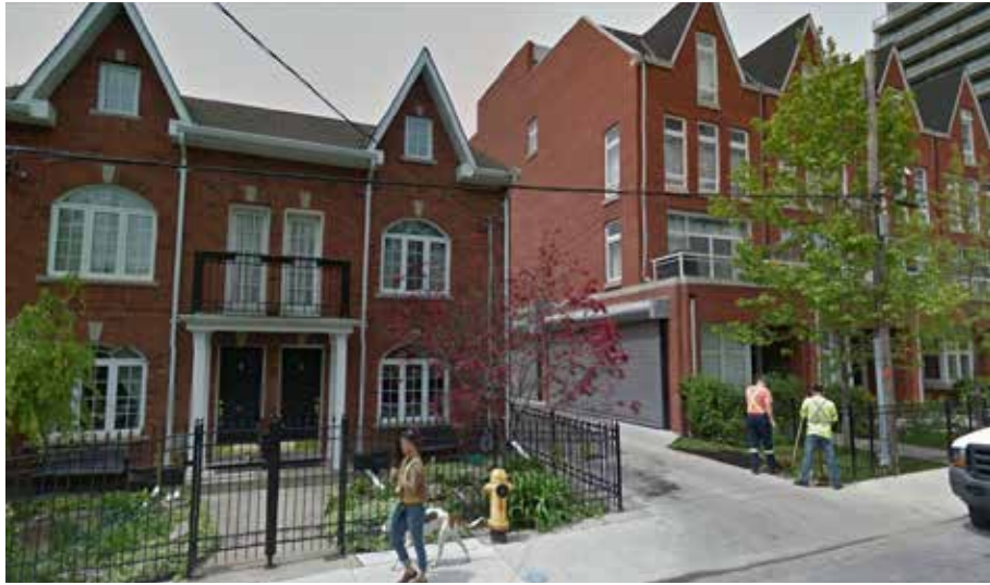
Duplexes and Townhouses side by side