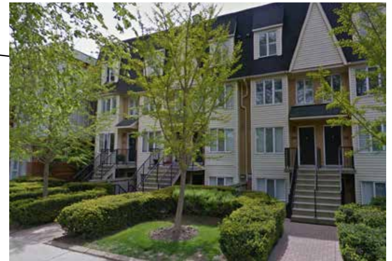
Single Unit Townhouses