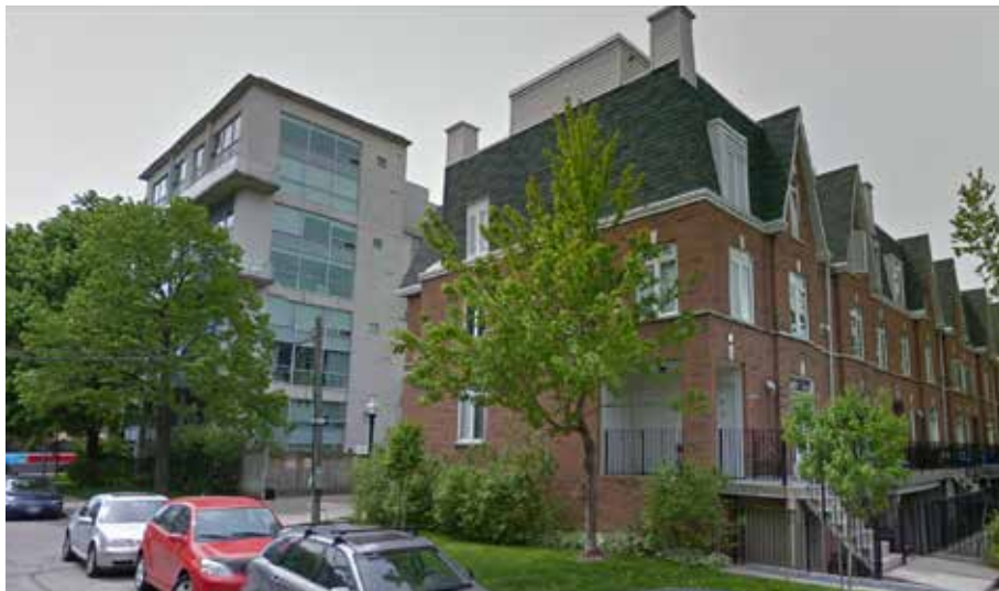
Apartments and Stacked Townhouses side by side