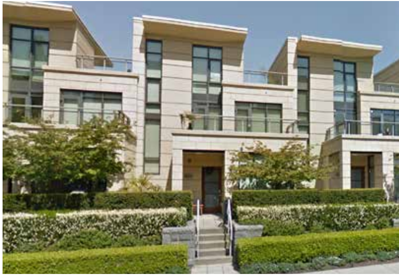
Single Unit Three Storey Townhouses