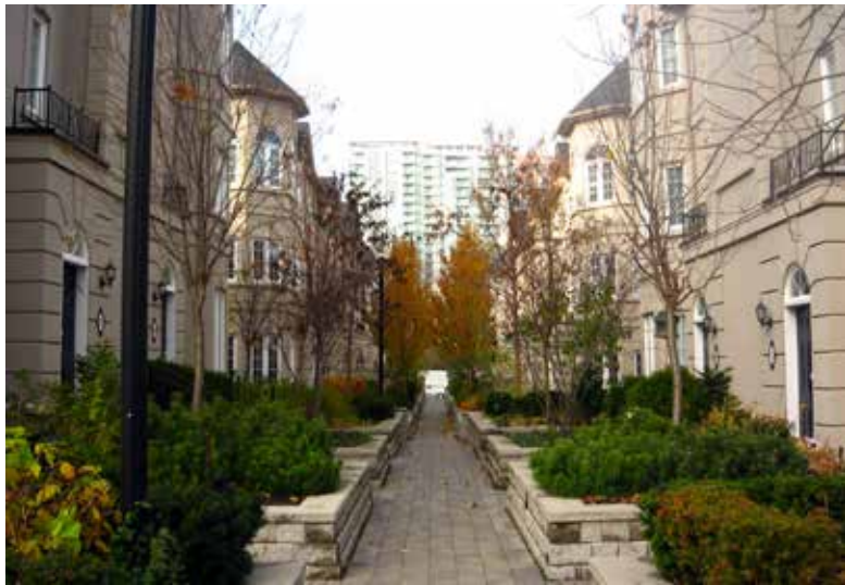
Back to Back Townhouses - Internal Courtyard/Pathway View