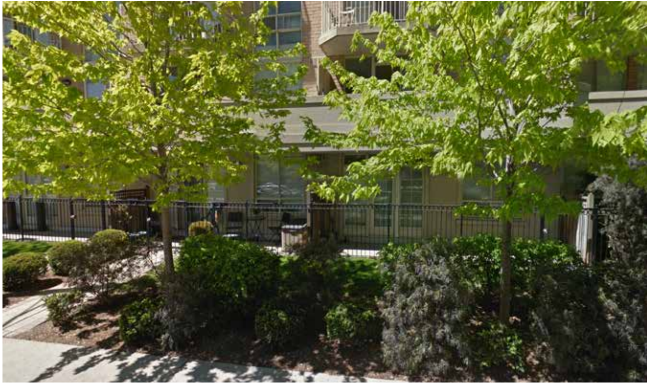
Apartments: At-grade entrances and common entrance for upper units