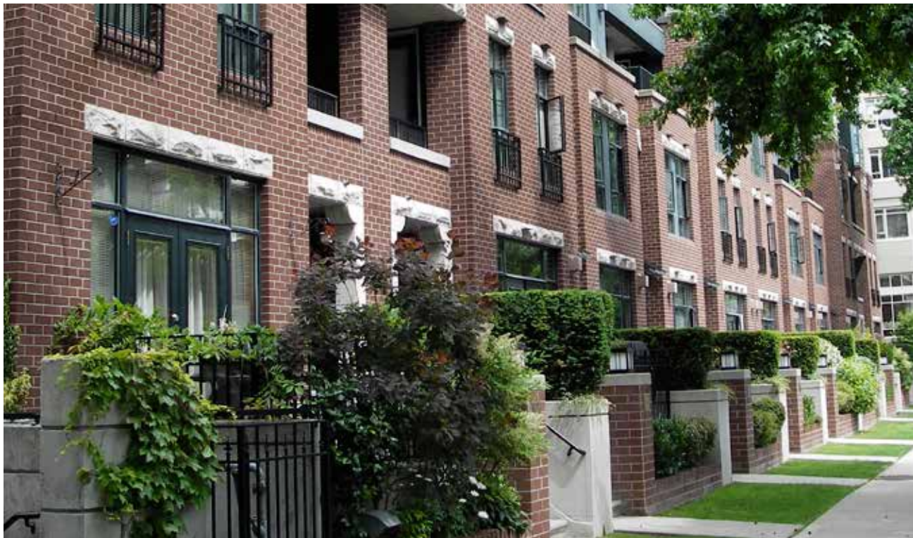
Apartments: At-grade entrances and common entrance for upper units