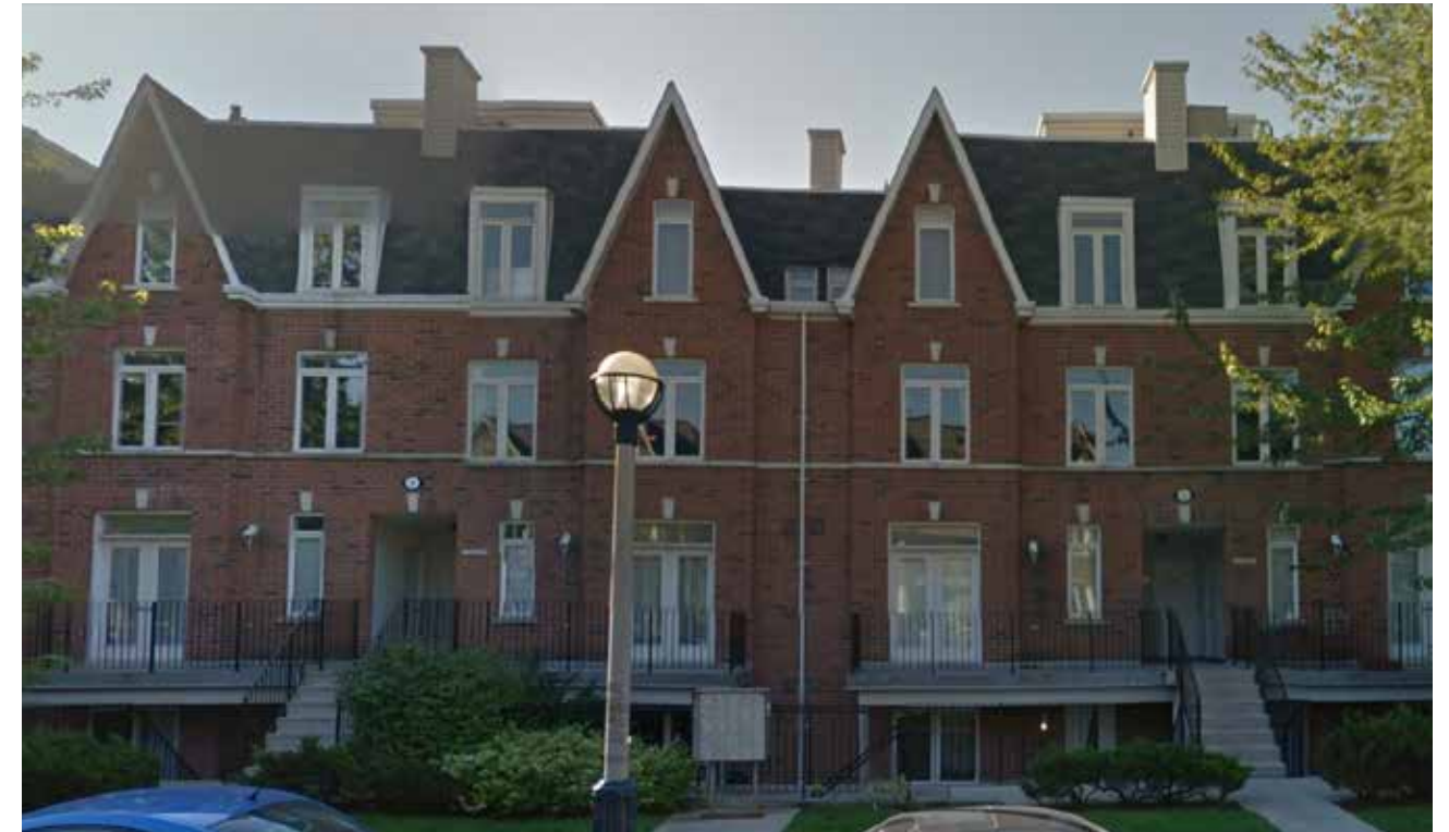
Three Storey Stacked Townhouses: Double units with common stairway but individual door entrances for upper and lower units