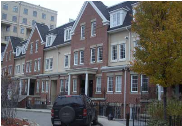
Double Unit Three Storey Stacked Townhouses