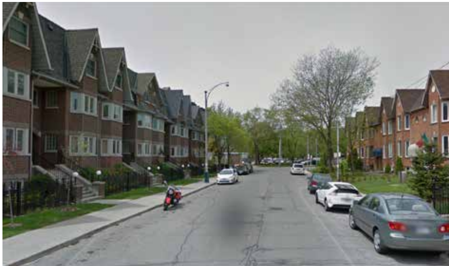
Duplexes (east side) and Townhouses (west side) along the street